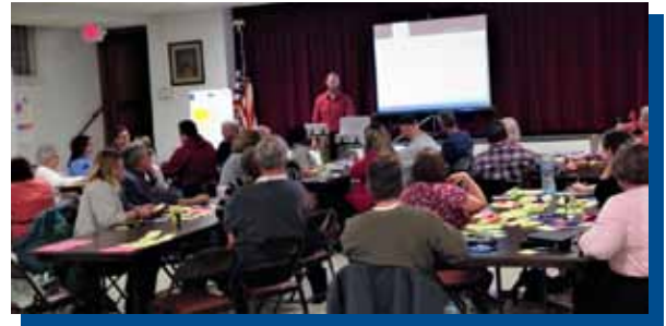
Asset Mapping on Jan 26th, 2017 with 27 Epiphany members plus 6 community partners including 4 Woerner School teachers